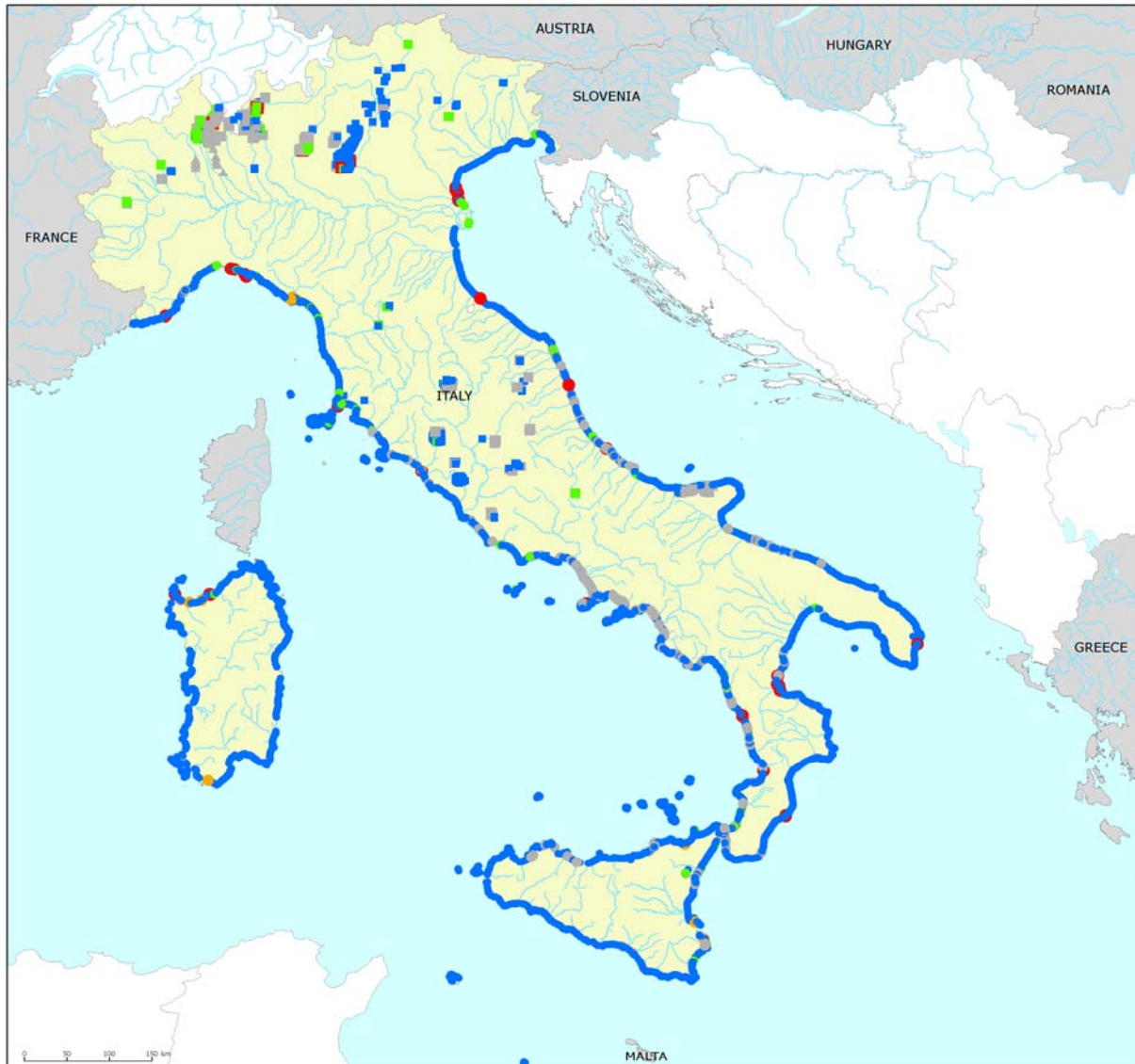
Map 1: Bathing waters reported during the 2008 bathing season in Italy